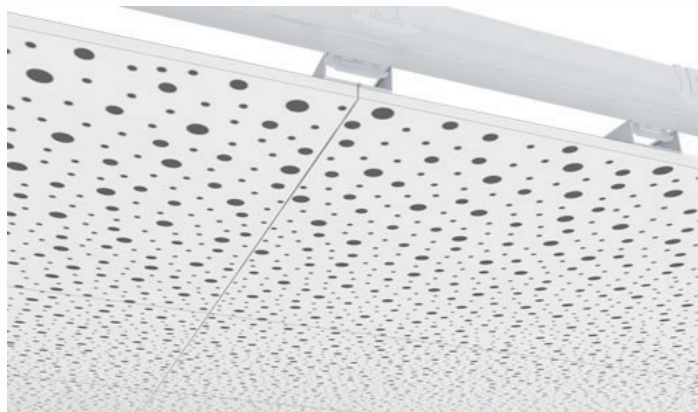
Stratopanel Random G8/15/20 — UFF