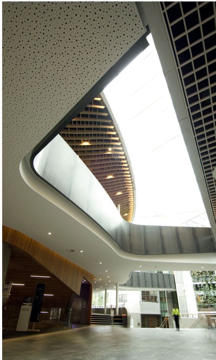
Sir Paul Reeves Building, AUT

Current stock subject to prior sale, lead times may apply, consult Asona for availability.