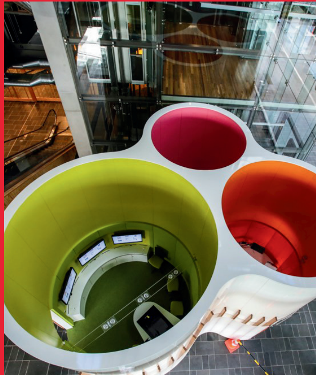
TECHNICAL DATA SHEET - BPIR CLASS 2