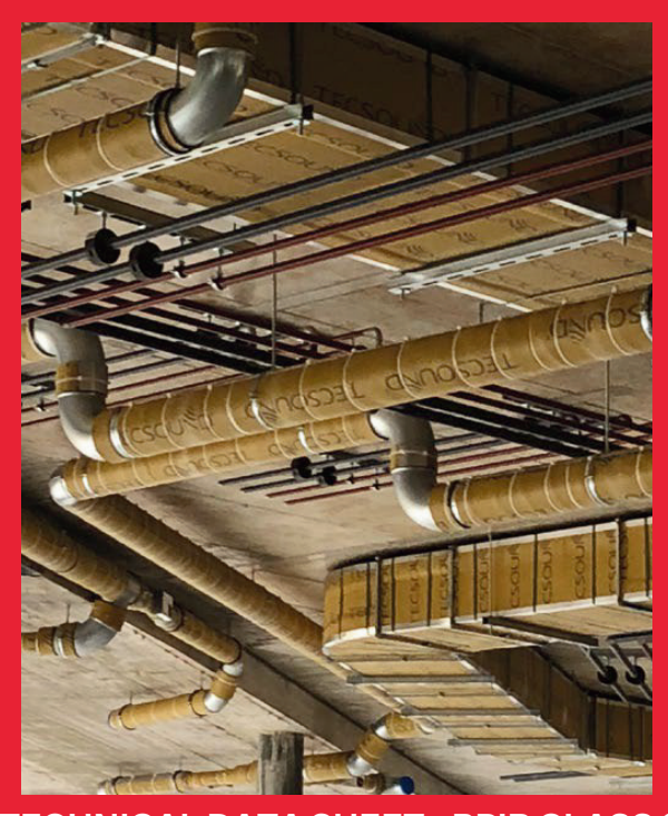
TECHNICAL DATA SHEET - BPIR CLASS 1