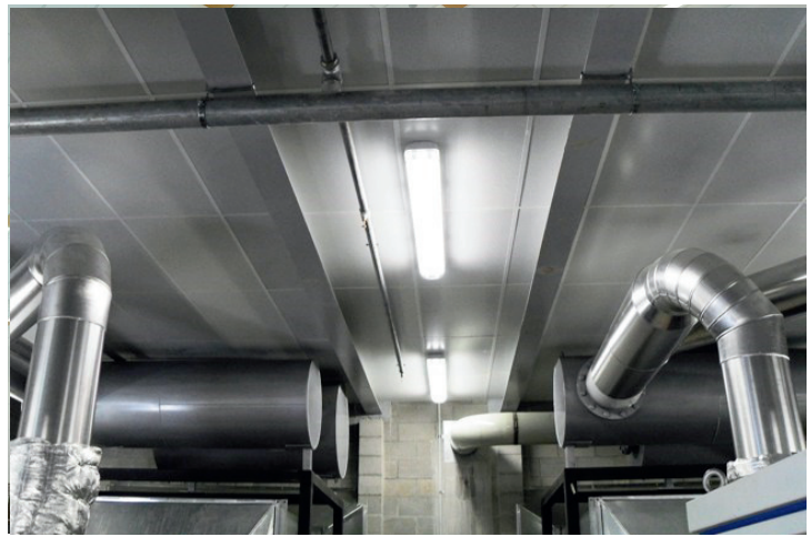
Waikato Hospital Equipment Room