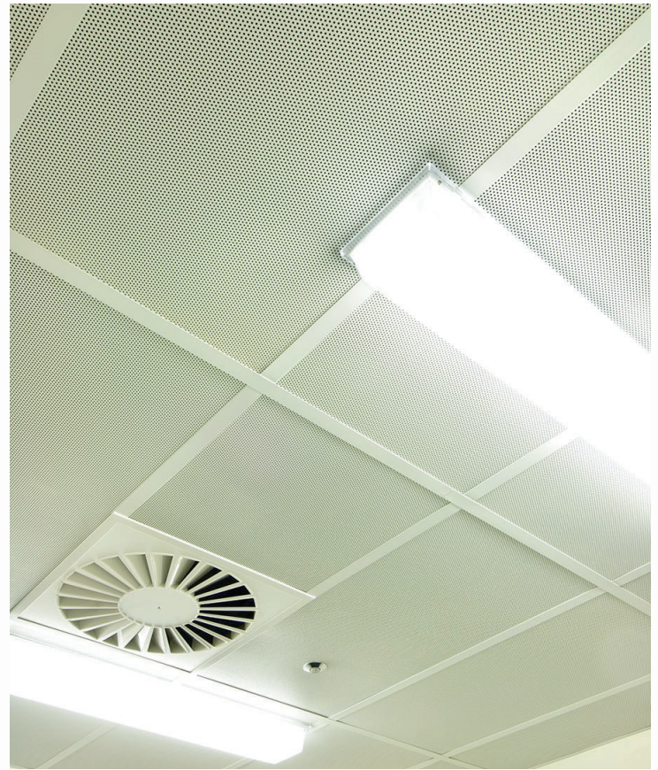
Manukau Police Station—Hard Interview Room