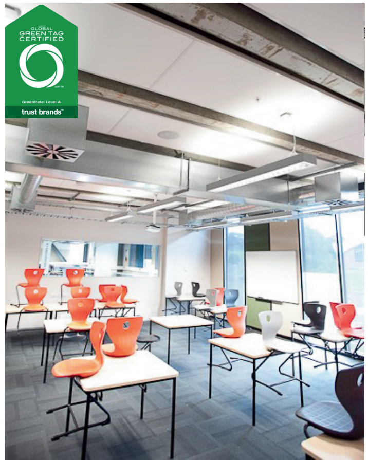
Goodman Feilder—Training Room

15 year limited warranty against manufacturing defects, extendable to 30 years when registered for Asona's Renew and Reuse program.