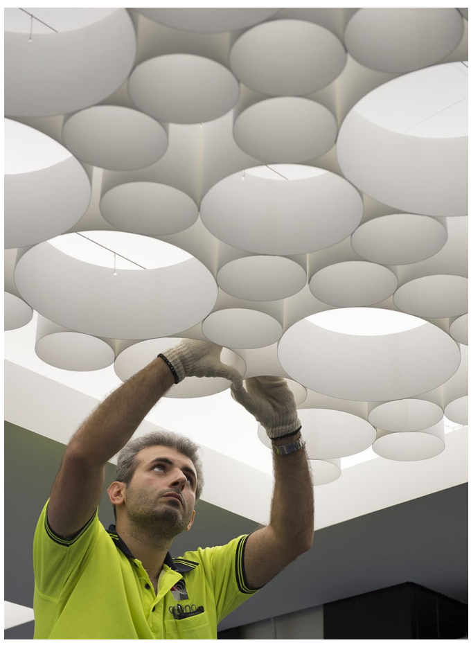
Installation of AO-Gami tubes in ASB Queen Street Branch

(Asona ceiling Masterspec 5172AA specification available).