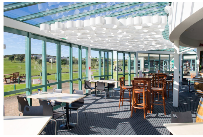
Gulf Harbour Country Club, conservatory