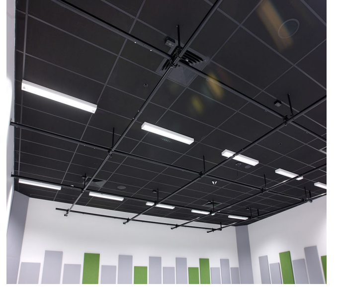
Photo: Hobsonville Point Secondary School, Triton 25 with black Sonatex facing