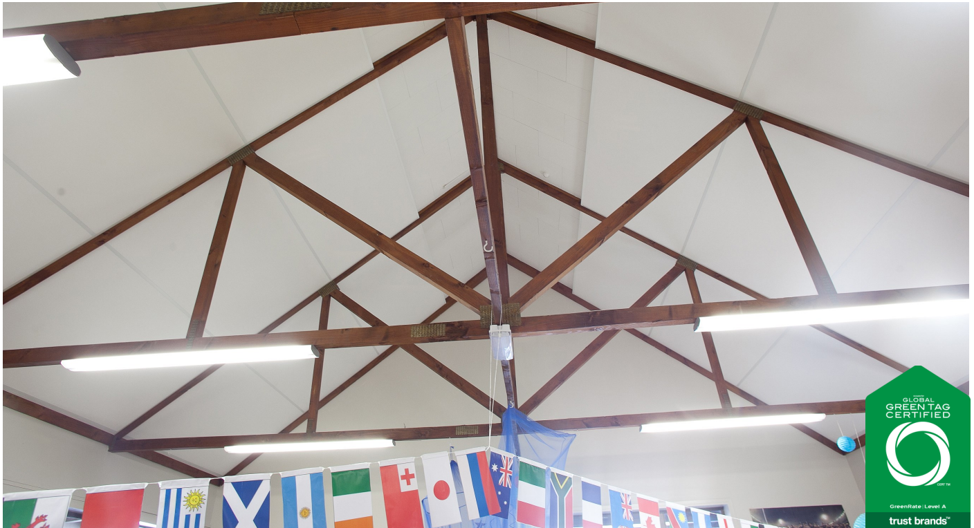
Photo: Triton 50, 2400 x 1200 panels direct fixed over plasterboard lining in retro fit of existing classroom.