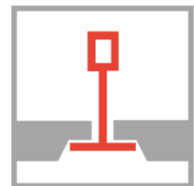
6 / rebated