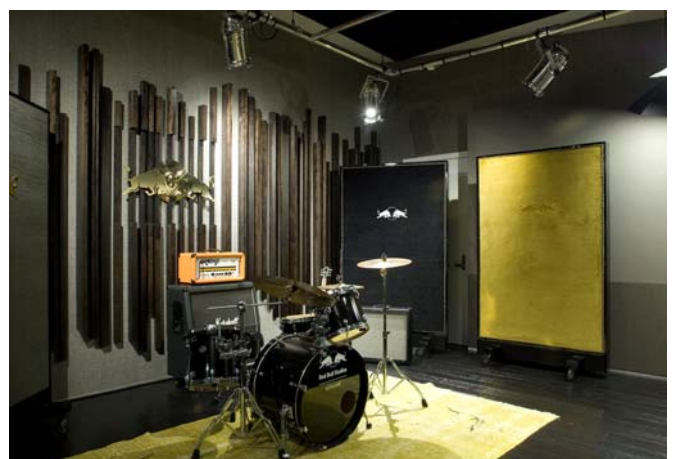
Red Bull Studios, Auckland